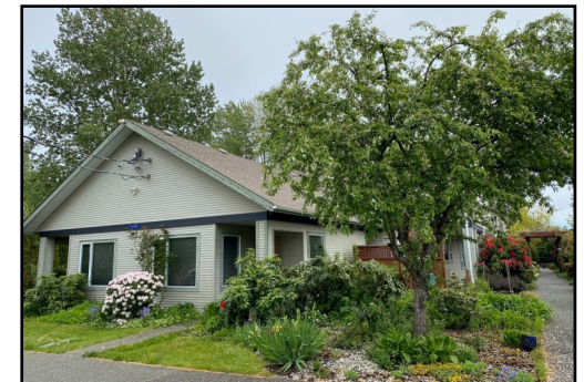
Level UP @ The Station is funded by Island Health.